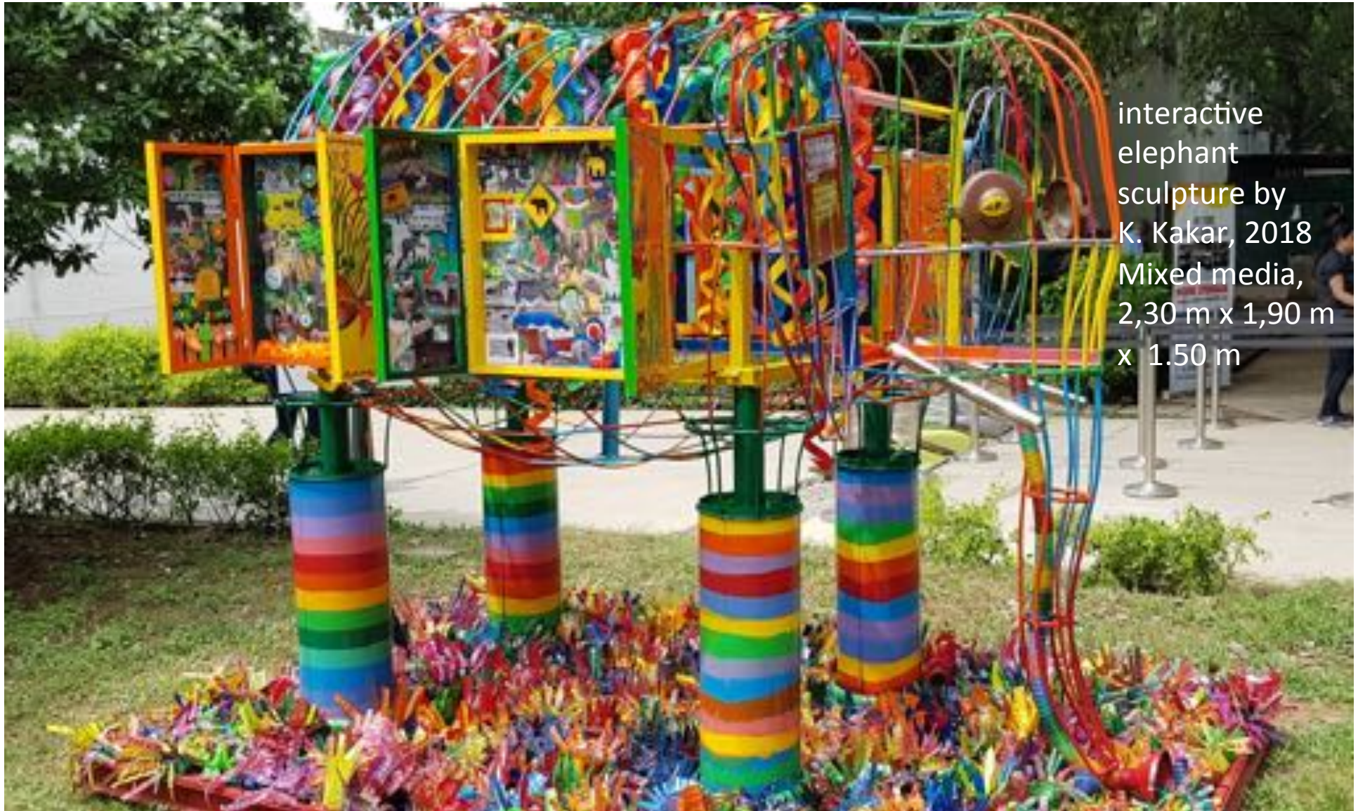
interactive elephant sculpture by K. Kakar, 2018 Mixed media, 2,30 m x 1,90 m x 1.50 m

101 artists across India were asked by curator Dr. Alka Pande to contribute an elephant sculpture for the nationwide campaign of Wildlife Trust, India, to promote the creation of elephant corridors.