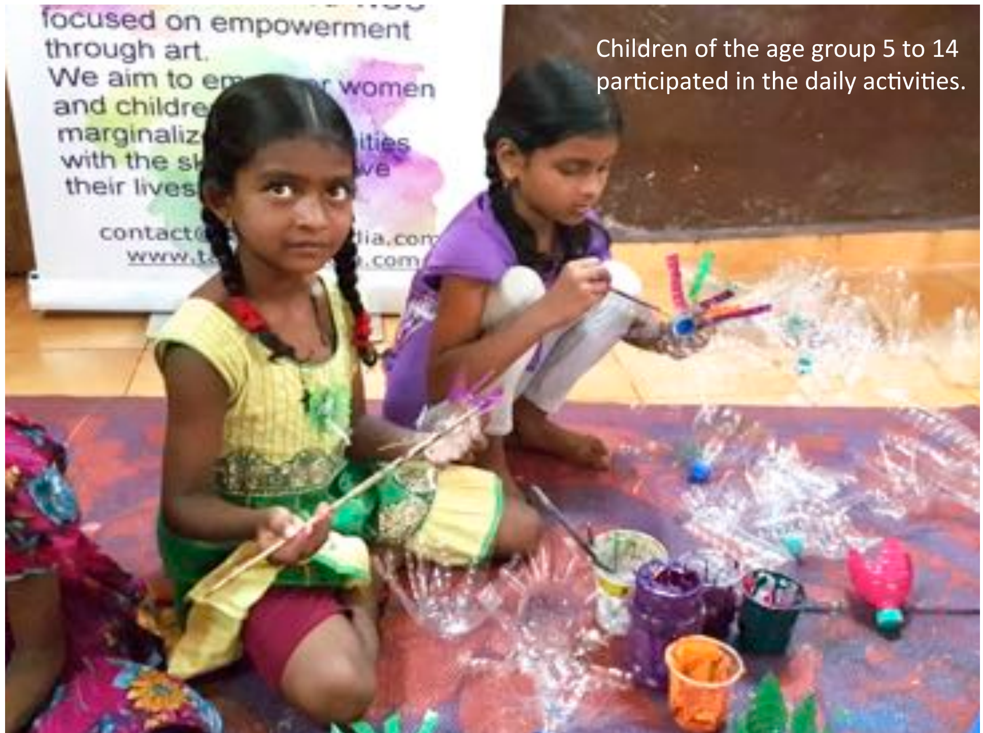
Children of the age group 5 to 14 participated in the daily activities.